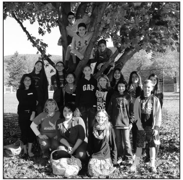
Math team members participated in Alfred University's Nevins Math Competition in November.